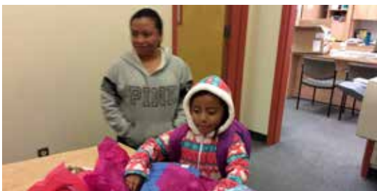
Inner City Schools

This project serves four schools in downtown Los Angeles, where many families live on less than $10,000 a year and in shelters or transient housing. Public schools have received less and less government funding for school and art supplies in recent years; non-affluent districts do not have the means to fill in the gap for student needs. The Inner City Schools Project provides monthly donations of art and school supplies, books, clothing, blankets and food.