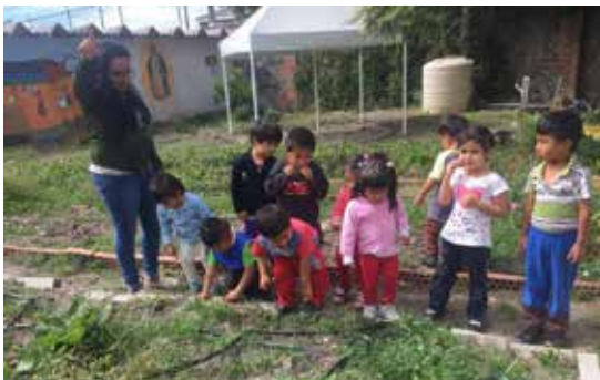
A Child's Garden of Peace

A Child's Garden of Peace works with low-income communities to create gardens where children can play in peace and learn to grow food for themselves and their families. In 2018, the project collaborated with Wawa Illari (another Susila Dharma project) in Pachacamac, Peru. Families were trained in organic gardening techniques, enabling them to grow nutritious food for their children that they could not otherwise afford to buy.