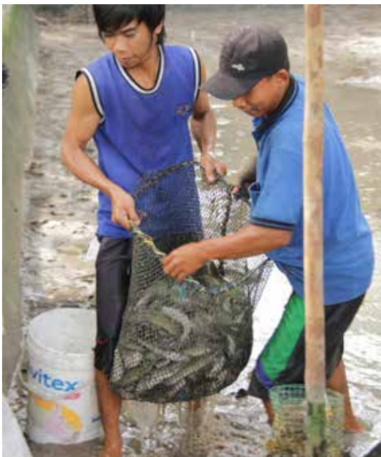
Yayasan Tambuhak Sinta (YTS)

YPK provides permaculture education and trainings in Central Kalimantan. Once home of the world's second largest virgin rainforest, today the region has been largely destroyed by forestry, slash and burn agriculture, and mining. Through permaculture, a system of integrated design that supports the resilience and sustainability of communities, YPK demonstrates sustainable and ethical ways to improve land management, increase community resilience and food security, and conserve the natural environment. The project has been growing and successfully spreading its environmental message among the community, especially among children. In 2018 SD USA's grant went for operating expenses that enable success of the whole enterprise.