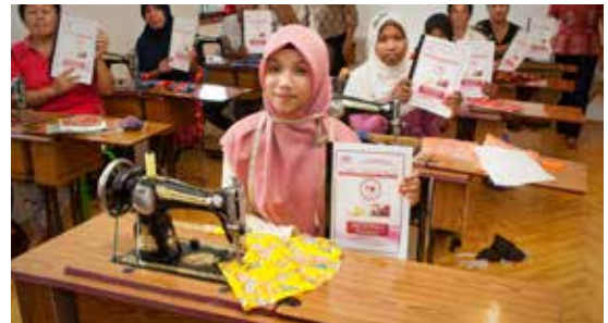
Yayasan Usaha Mulia (YUM)

One of Susila Dharma's longest-running projects, YUM has been empowering the lives of Indonesia's poor for over 40 years. The project operates numerous sustainable social welfare and environmental projects in Kalimantan and Cipanas, West Java. Their programs, directly serving local villagers, include vocational training, computer training, English language classes, health education, and much more. SD USA's grant helped with overall operating expenses.