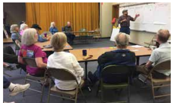
Sierra Arts and Community Center