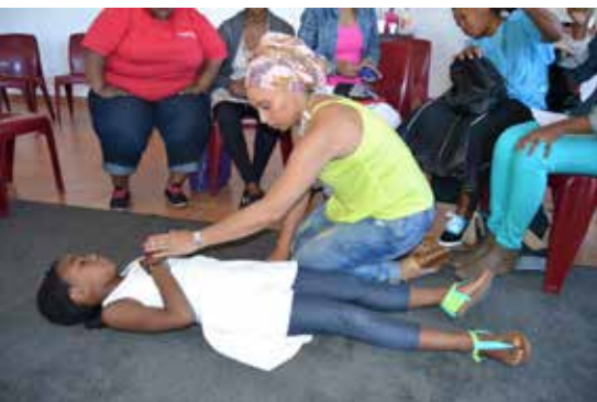
I Protect Me

I Protect Me teaches children how to protect themselves from sexual and gender-based violence that is widespread. Its goal is to raise awareness and provide self-protection training in schools with the hope that a new generation of South Africans will emerge, who will know how to set personal boundaries and respect them. In 2018, over 5000 primary and secondary students and 1000 parents were trained. The SD USA grant helped to fund