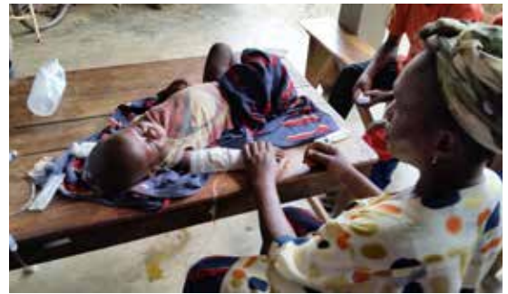
Mother and Child Hospital at Kwilu Ngongo

SD USA made a small grant that helped with the creation and running of a new hospital at Kwilu Ngongo in DRC. The focus of the hospital is healthcare for mothers during pregnancy and childbirth, and on infants during their first three years. The project has been such a success that they had no need to apply for further grants from Susila Dharma.