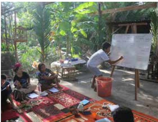
Yayasan Permakultur Kalimantan (YPK)

BFIA serves underprivileged children and youth through football (soccer) and education. An important component of the project is Healthy Environment = Healthy Children, a program that supports health and nutrition activities, with special emphasis on the need for conservation of ecosystems. BFIA makes it possible for Kalimantan's youngsters to "go out and play" in a healthy and safe environment. Additionally, the project aims to provide education and support in health and nutrition, and basic English instruction. SD USA's 2018 grant supported the "Healthy Environment = Healthy Children" project.