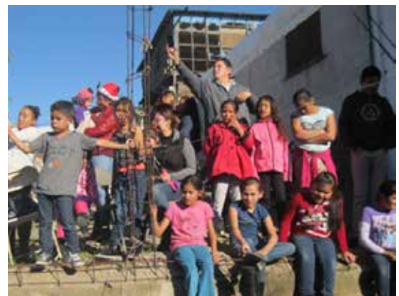
Tijuana Family Outreach Project

Working in conjunction with Subud San Diego volunteers, this project supports approximately 70 children and adults from El Florido, a low-resource area on the outskirts of Tijuana, Mexico. Most of the residents live in shacks and work in the local brick plant. The project offers resources for families to improve their lives and build relationships with neighbors, providing community integration to isolated families. Ongoing projects include holiday celebrations, donations of school supplies, clothing and other essentials, monthly baking classes, and monthly lunches with life-skills workshops facilitated by staff from the local university.