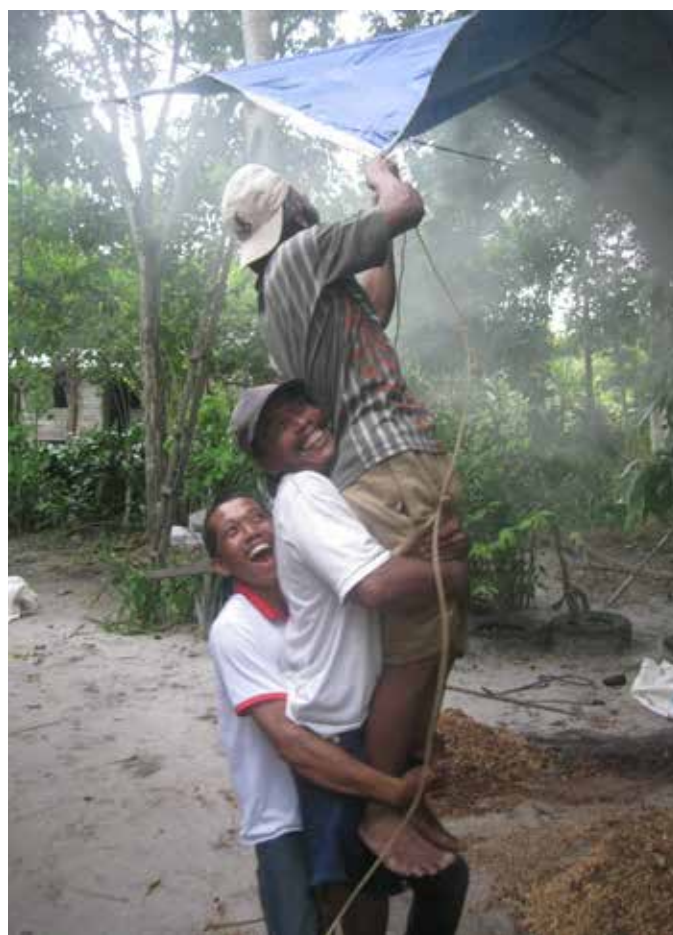
YPK—Getting the job done