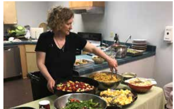
Quest Center for Integrative Health

The Quest Center provides healthcare services, education and inclusive community support to individuals seeking a wellness-focused approach to fully living. They serve marginalized communities such as people living with HIV, addiction, chronic pain and mental health issues. SD USA's 2018 grant went to support Quest's Community Nutrition Nights, weekly dinners that nurture, support and empower the community through shared meals and workshops.