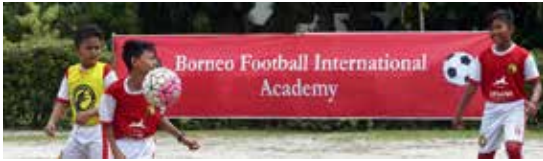
Borneo Football International Academy