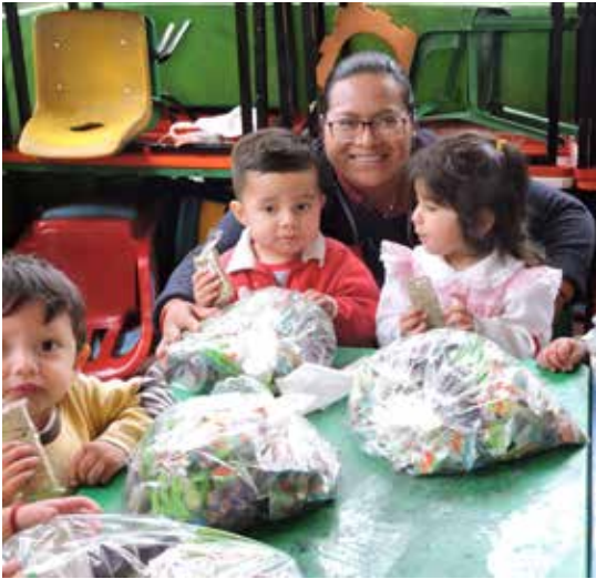
Usaha Mulia Abadi