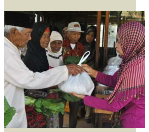
YUM's Elderly Health initiative helps the community by helping its elders maintain health and proper nutrition..