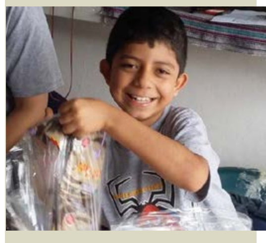
Usaha Mulia Abadi provides Nutritional Supplements to children. Everybody helps out.