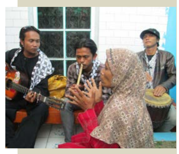
An urban street band—YSS works with teenagers and young adults to provide training and opportunities.