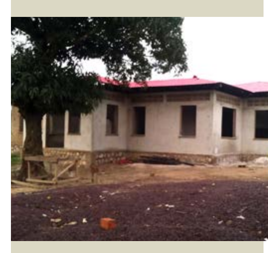
The new hospital building at SD DRCongo's "Mother and Child Hospital at Kwilu Ngongo