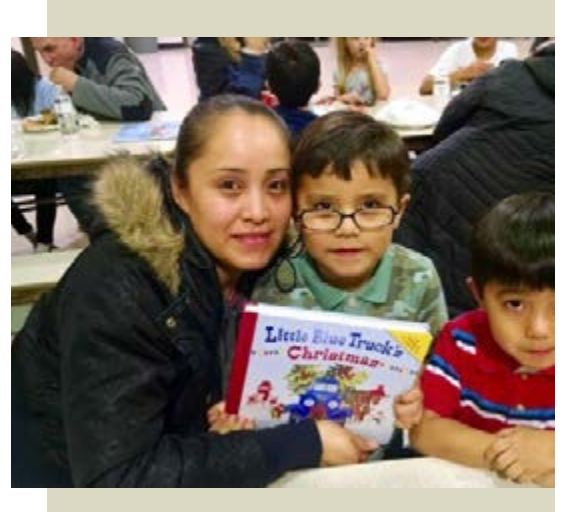
ICDP brings training in parenting for parents and caregivers to many fractured communities around the world, including the United States.

Subud San Diego worked with Los Ladrilleros (the brickmakers community) in Tijuana, Mexico.