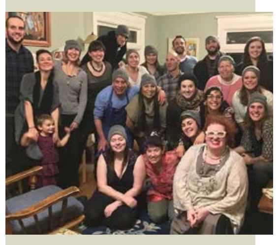
Quest Center for Integrative Health provides health services and support for HIV, addiction recovery, cancer survival, and homelessness.