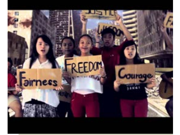
BCU Students are active participants, working to improve life in Kalimantan.